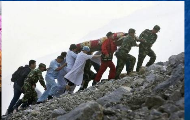
Soldiers and rescue workers working around clock to rescue people still buried. Unable to transport heavy machineries to the remote areas since roads are buried by landslides, they often have to use hands to move tons of concrete.