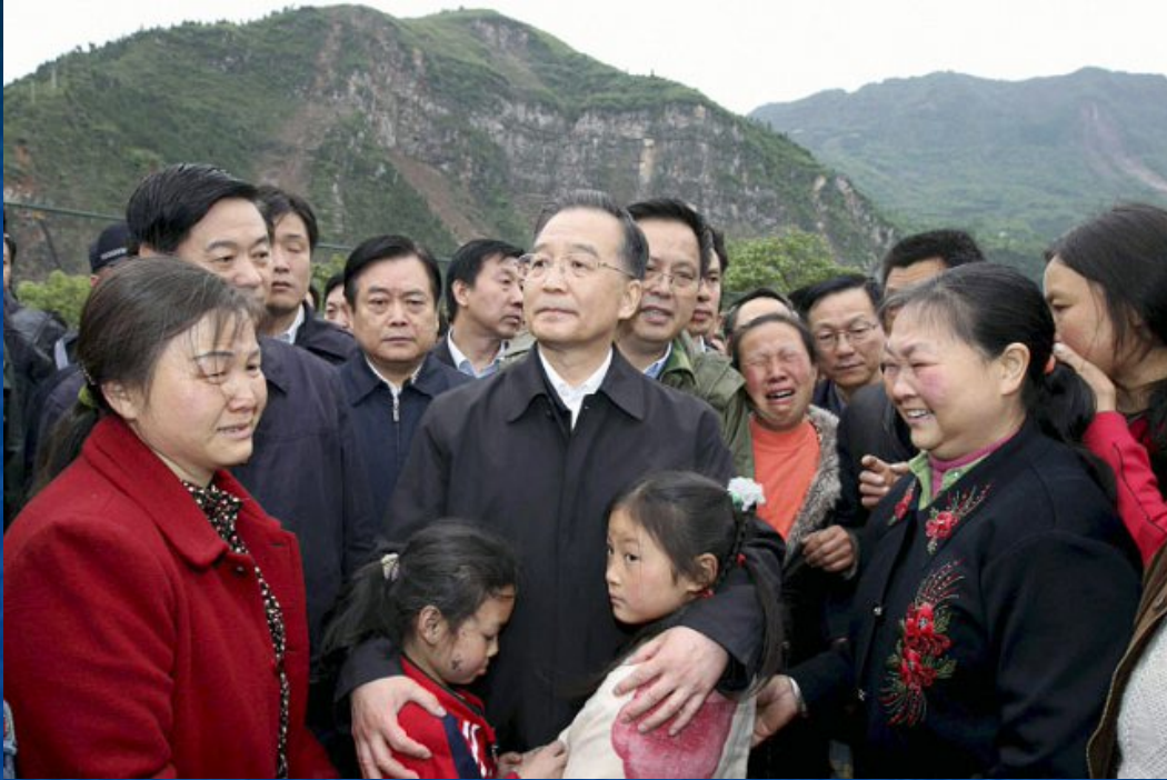
Wen Jiabao (温家宝), 66, Chinese Prime Minister, boarded on a plane 30 minutes after the earthquake, and arrived in disaster area in 2 hours. He has been the chief of the rescue operation since then, working almost around clock at the frontline with rescue workers.