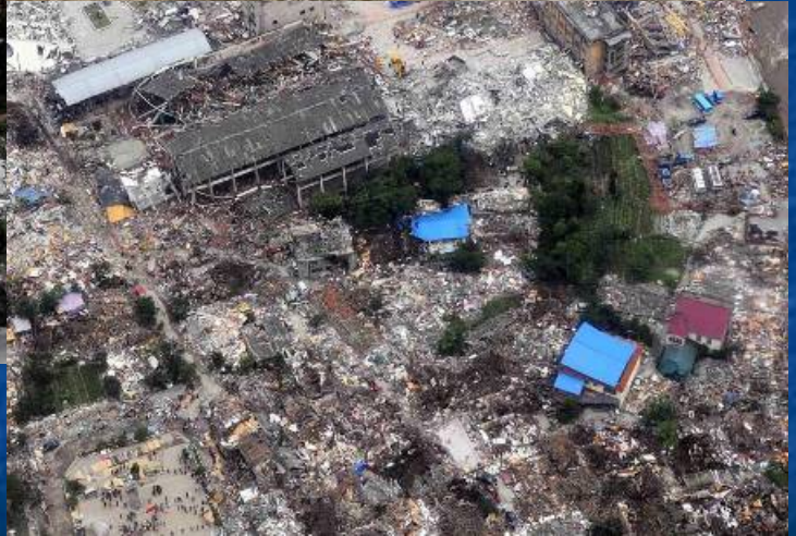
Cities close to the epicenter are flattened; whole mountains collapsed.