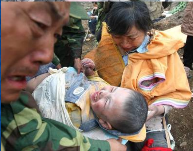
A 5 year old boy was rescued after being buried under rubbles for 24 hours. His left hand was broken, but he smiled and saluted to his rescuers. His smile made everybody cry.